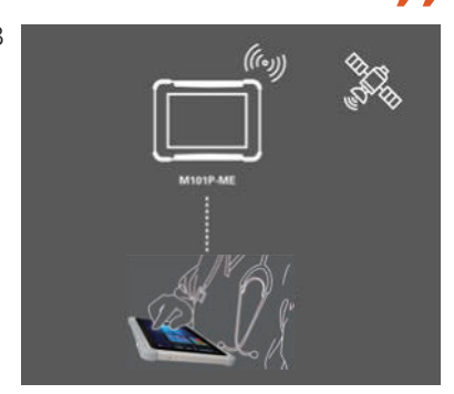
Application Diagram: Patient Care