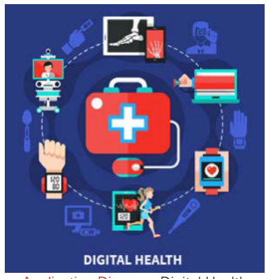
Application Diagram: Digital Health