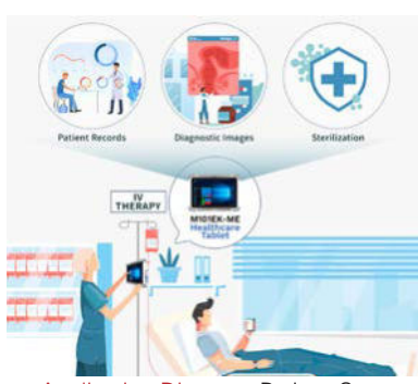
Application Diagram: Patient Care